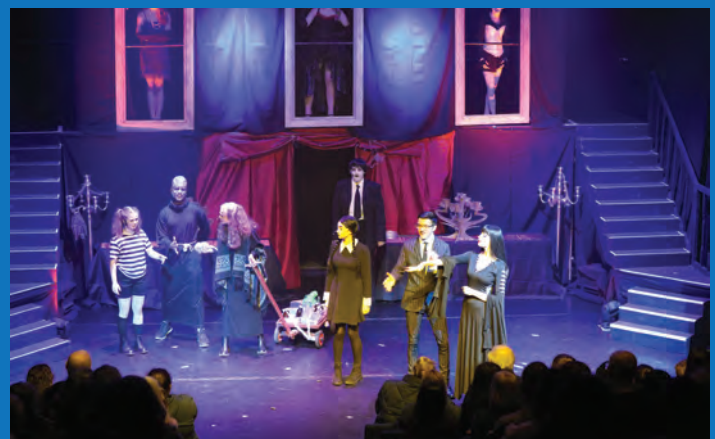
The Addams Family production 2024.