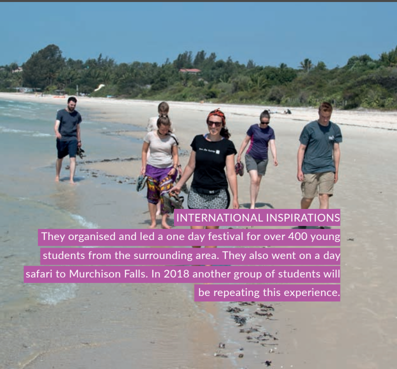
INTERNATIONAL INSPIRATIONS They organised and led a one day festival for over 400 young students from the surrounding area. They also went on a day safari to Murchison Falls. In 2018 another group of students will be repeating this experience.