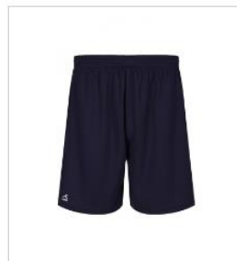
Whittonstall First School NEW PE Shorts