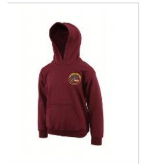
Whittonstall First School PE Hoodie