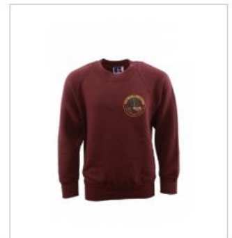
Whittonstall First School Sweatshirt