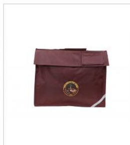
Whittonstall First School Book bag