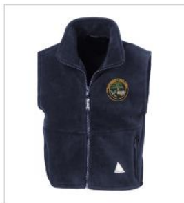
Whittonstall First School Fleece Bodywarmer - NAVY