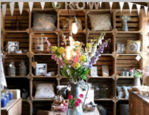
Farm and Craft Market

Sunday the 1st of May and Saturday July 23rd.