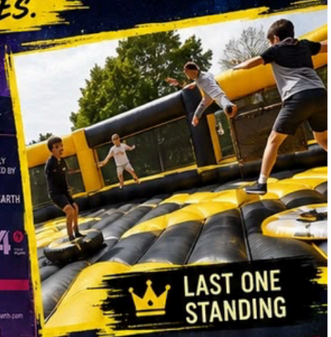
LAST ONE STANDING