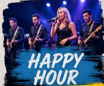
HAPPY HOUR FANTASTIC LIVE PARTY BAND!