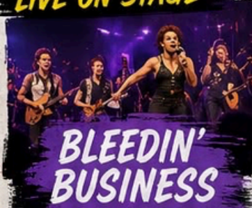
BLEEDIN' BUSINESS SOUL & MOTOWN