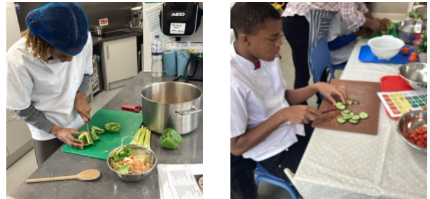
Making vegetable pasta bake and a mixed salad