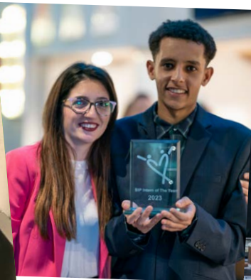
Supported Employment Partner