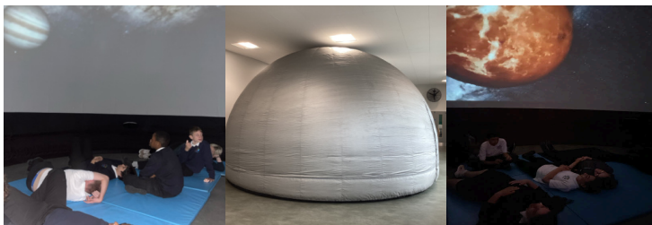
Space Dome Photos

Senior Leader for Wellbeing and Behaviour