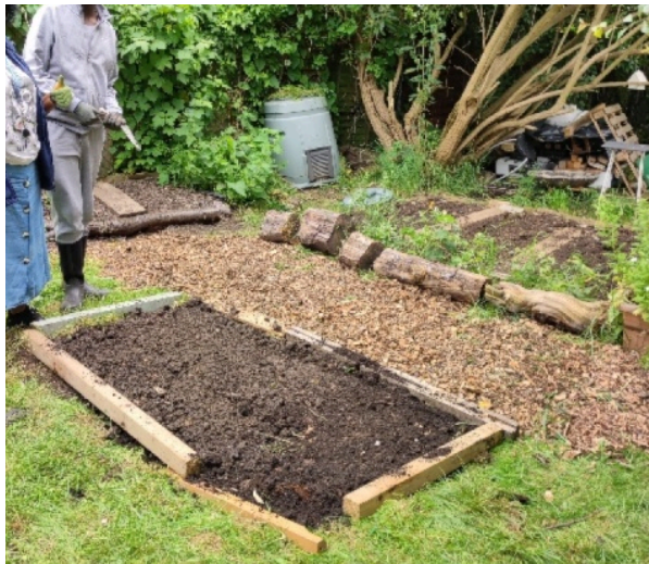
Newly made beds on the allotment and the 6th form garden