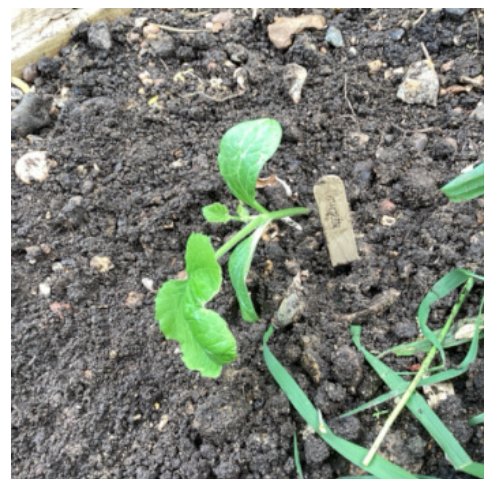
Potting-on seedlings in the 6th form garden and our first courgette plant growing at the allotment