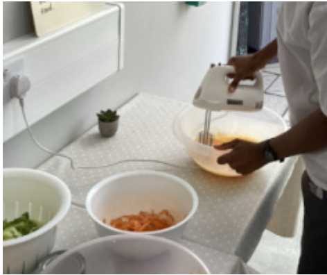
Using an electric whisk and making chicken kebabs