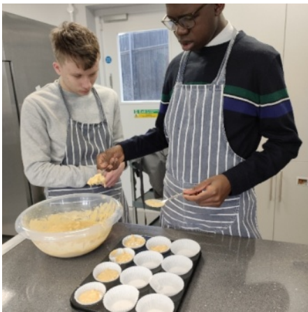
Working together to make apple and banana cupcakes.