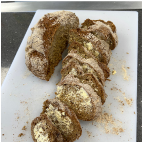
Homemade soda bread