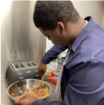
Preparing the tuna fish cake recipe