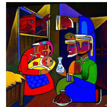
James He Qi The Magi

Find examples of religious art depicting grateful and generous. The examples could come from scripture stories or lives of the saints. Create your own images to express these virtues. Please see 'Using Art to Develop Thinking Skills in RE document' to support questioning.