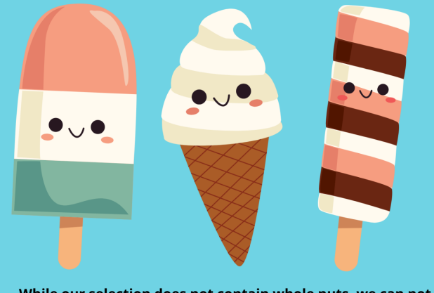
While our selection does not contain whole nuts, we can not guarantee they are nut free. Please ask to check ingredients, original packaging will be available.

All items cost £1. While cash is preferred, card payment can also be accepted (please note this is a slower option).