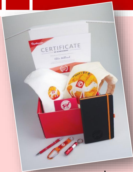
Chloe Millband Favourite place: TUNISIA