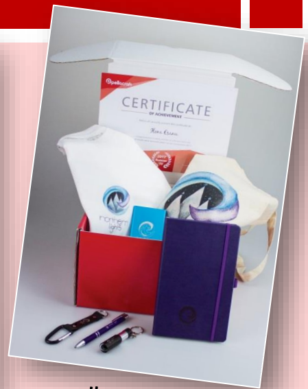
Ilona Esanu Favourite place: Northern Lights (NORWAY)