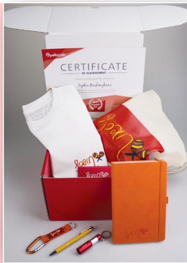
Sophie Buckingham Favourite place: SPAIN