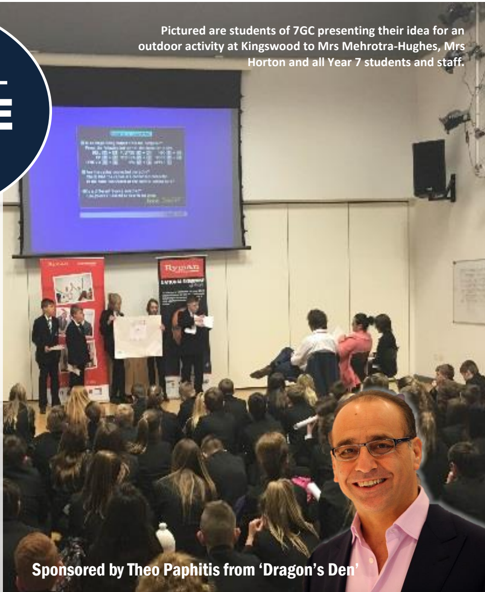
Sponsored by Theo Paphitis from 'Dragon's Den'

The winning group were from 7JD with their idea for 'Crazy Bowling'. They will travel to Doncaster Race course to compete against other schools and present their idea to a panel of celebrities.