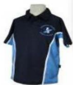
Boys PE Top