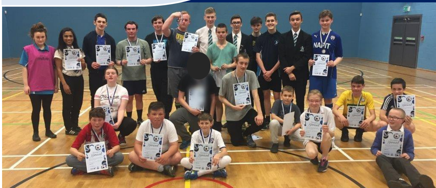
Pictured are; Shirebrook Academy Ambassadors and Stubbin Wood Students with their medals