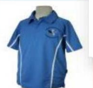
Girls PE Top