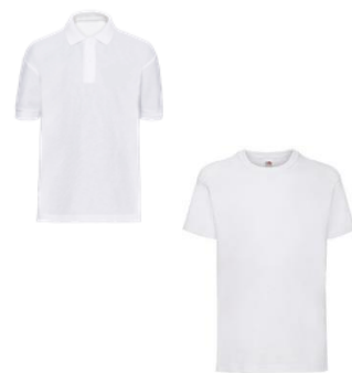
NEW Value Range Polo