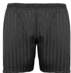
PE Shadow Stripe Shorts