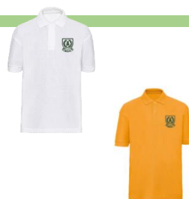
Premium Range Polo Shirt with Logo