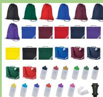
PLAIN SCHOOLWEAR BOOK BAGS AND ACCESSORIES