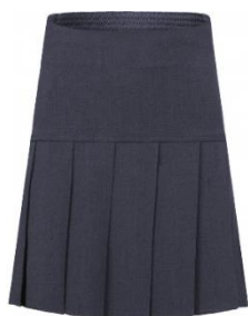
Girls Fan Pleat Skirt NEW for 2024 – Straight Skirts arriving soon