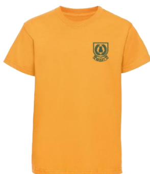
Premium Range PE T-Shirt with Logo