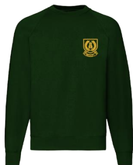
Orchard Crew Neck Sweat with Logo

WORKWEAR | SCHOOLWEAR | EMBROIDERY | PRINTING