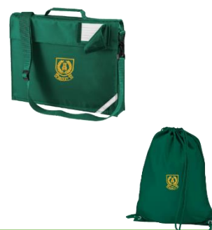
Bookbags with logo Gymsac with logo