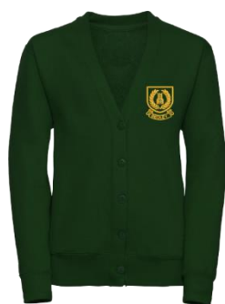
Orchard Sweat Cardigan with Logo