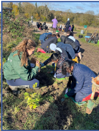
Bertha Earth nature connect day