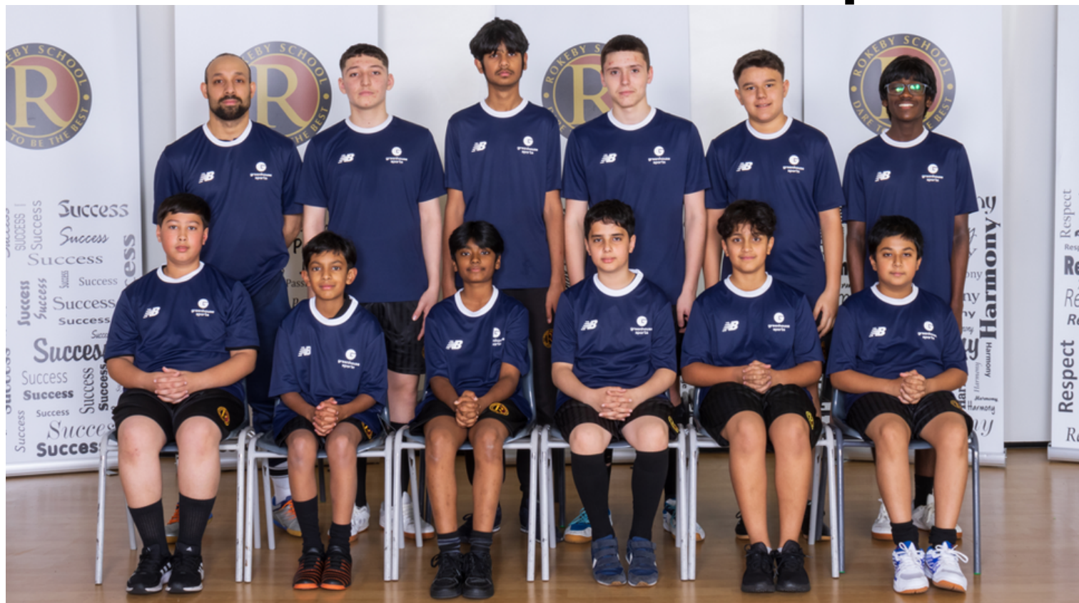
Table Tennis National Competition