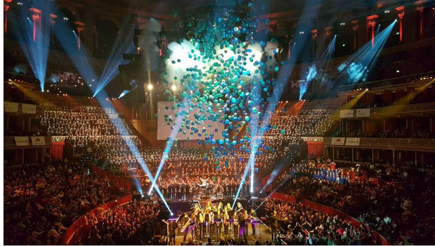
Full Circle performance at The Royal Albert Hall, November 2020

BTEC First Awards are primarily designed for learners who want to study in the context of a vocational sector.