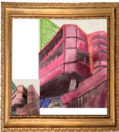
Ivan 9B Paper collage & watercolour response