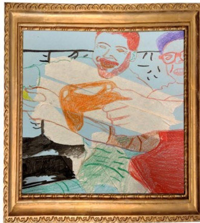
Nehab 11Y 'Gamers' mixed media study