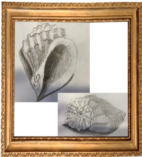
Key stage 3: Anmol (80) Shell studies in pencil