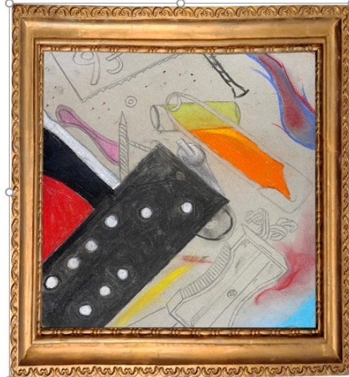
Key stage 4: Mohammed (10Y) Mixed media observational study