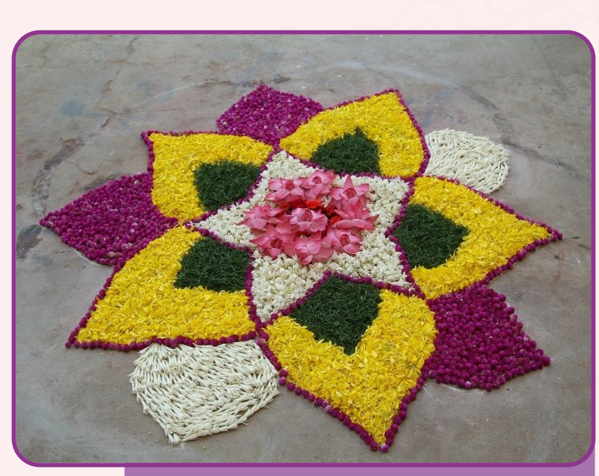
What colours can you see?

Rangoli can be made using lots of different things. Some people make them with flowers. They can also be made using coloured rice or powders.