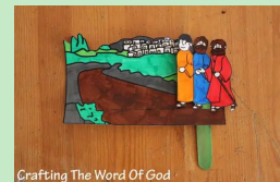
Crafting The Word Of God