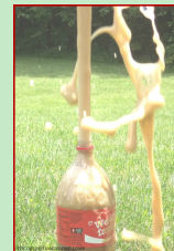
Coke & Mentos Geyser Fun, messy science for kids

This is an oldie but somehow irresistible fun every time. You can find photos and video in the Messy Church Does Science resources. Make a funnel from the paper and pour the Mentos as quickly as you can into the newly opened bottle of coke. And STAND WELL BACK!