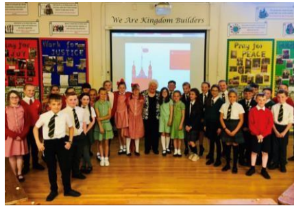
Discussing the House of Lords with the Baroness of Richmond