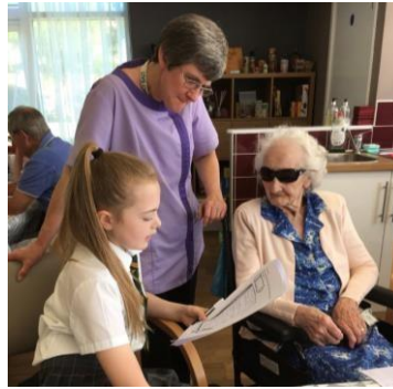
Poetry reading to our friends at the Dementia unit