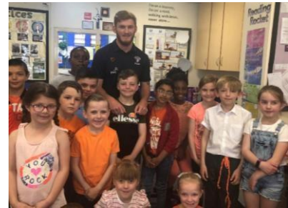
Vocations Week: Discussing the future with a wide range of different adults

Our vision is for all children to be confident speakers who enjoy conversing. Furthermore, we want children to be able to speak clearly and audibly, pronouncing words correctly. We strive to develop children so that they can confidently address different people or groups for a range of different purposes. We teach and use an extensive vocabulary and want our children to be articulate communicators. We aim for all children to be able to listen and carefully and respond appropriately. With support we know that they will be able to think of interesting questions with which they can build discussions. Communication will be informative, entertaining and purposeful.