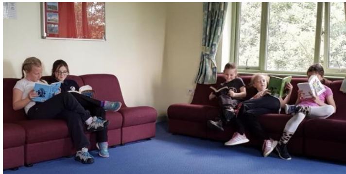
Reading for pleasure during Carlton Outdoor Activities residential