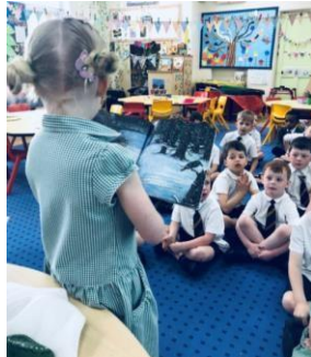
Sharing stories with peers