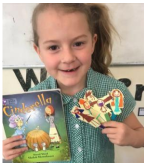
Bringing stories to life