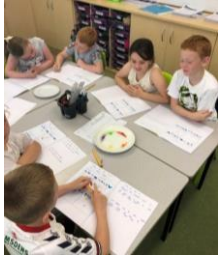
Science investigations, writing observations