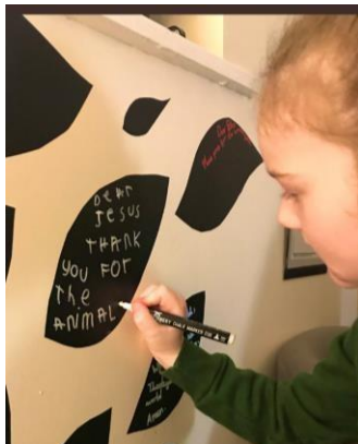
Prayers for our prayer walls authors