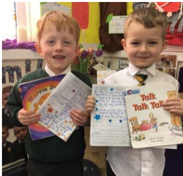
Celebrating reading achievements

Our vision is for all children to be competent, enthusiastic readers. We aim to develop children who are so enthused by reading. We want enthusiastic readers who choose to pick up a book in their free time and become totally absorbed or choose to find and use literature to gain knowledge and understanding about the world around them. We want our children to love listening attentively to books and be motivated to look at or read them so we will take opportunities to read and share a range of books with our children. We want all children to be able to discuss a range of literature. We aim to develop a real interest in a variety of authors and genres. Reading will be pleasurable, informative and will develop a creative flair in children.