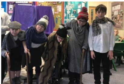
Drama: Acting Scene 1 from and the Chocolate Factory

Our vision is for all children to be confident speakers who enjoy conversing. Furthermore, we want children to be able to speak clearly and audibly, pronouncing words correctly. We strive to develop children so that they can confidently address different people or groups for a range of different purposes. We teach and use an extensive vocabulary and want our children to be articulate communicators. We aim for all children to be able to listen and carefully and respond appropriately. With support we know that they will be able to think of interesting questions with which they can build discussions. Communication will be informative, entertaining and purposeful.