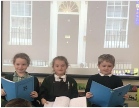
Young politicians in the making. Sharing our ideas for a better world