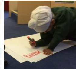
Eyfs writing for pleasure