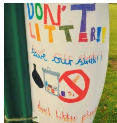
Sharing our messages for a better world with