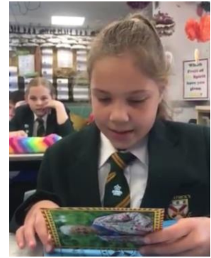
Reading responses from us favourite authors: Jacqueline Wilson

Our vision is for all children to be competent, enthusiastic readers. We aim to develop children who are so enthused by reading. We want enthusiastic readers who choose to pick up a book in their free time and become totally absorbed or choose to find and use literature to gain knowledge and understanding about the world around them. We want our children to love listening attentively to books and be motivated to look at or read them so we will take opportunities to read and share a range of books with our children. We want all children to be able to discuss a range of literature. We aim to develop a real interest in a variety of authors and genres. Reading will be pleasurable, informative and will develop a creative flair in children.