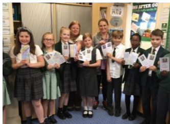
Prayer petitions to be taken to Lourdes

Our vision is for our children to become capable and confident writers who are well equipped for their own futures. We want to ensure children have a love of writing and enjoy creating pieces in a number of different genres. We aspire to give them a rich and varied curriculum which provides exciting opportunities for all writers to flourish. We want them to think about the many different purposes for writing and so we encourage them to do this by, writing short stories, song writing, writing to local MP's, writing prayers to read during masses in the local church etc. Writing will be skilled, creative, fun and purposeful.