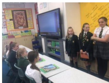
Sharing advice with other children