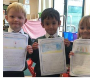
Recounts about trips: Visiting the seaside

Our vision is for our children to become capable and confident writers who are well equipped for their own futures. We want to ensure children have a love of writing and enjoy creating pieces in a number of different genres. We aspire to give them a rich and varied curriculum which provides exciting opportunities for all writers to flourish. We want them to think about the many different purposes for writing and so we encourage them to do this by, writing short stories, song writing, writing to local MP's, writing prayers to read during masses in the local church etc. Writing will be skilled, creative, fun and purposeful.