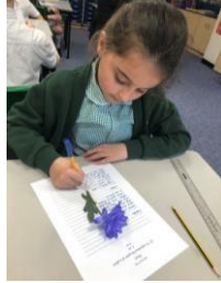
Nursery working with older children learning to label