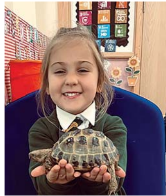
Ernie the tortoise