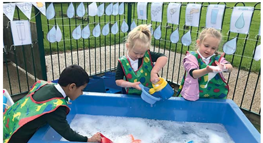
Pouring and measuring