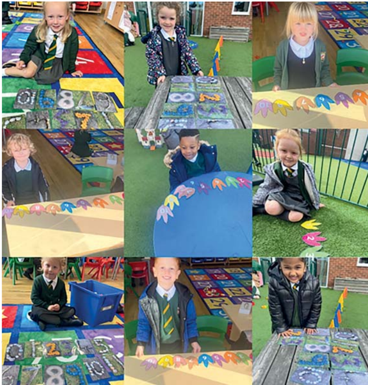
Learning our numbers

On return, we asked our children what they had missed about not being at school. Here are just some of their responses: