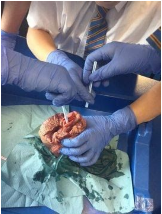
Dissecting hearts in Year 6.

Year 2 made models of habitats for different living things. They thought carefully about the features of the habitats and why the living things lived there.