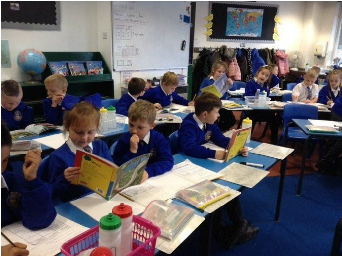
In Year Three, they were using non-fiction books to find out about Habitats.