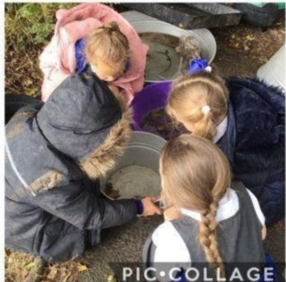
Year one looked for living things and recorded their findings.