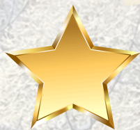
Class 1 - Jasper Class 2 - Harrison