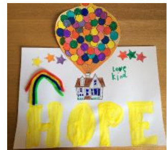
A poster of hope created by a Year 1 pupil