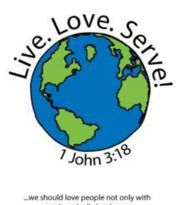
words and talk, but by our actions and true caring. 1 John 3:18