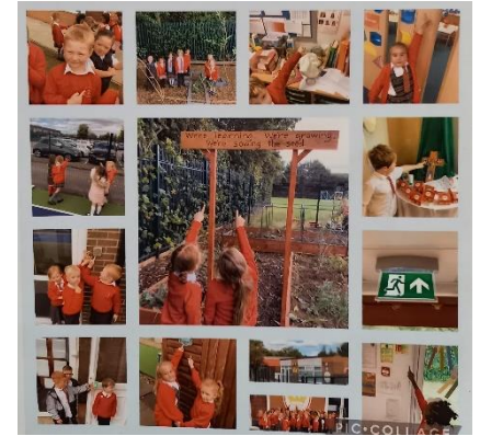
We explored different signs and symbols in and around our school