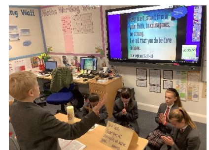
Drama linking to Corinthians 16:13-14