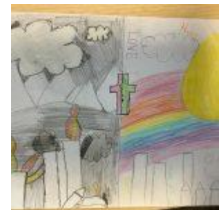
Artwork linking to Titus 3:12-18

Reveal is the heart of the process. The teacher and the children discover together the Christian understanding of the mystery of the Trinity: Father, Son and Holy Spirit. They explore the mystery of human life as revealed in the person, life and gospel of Jesus Christ Christians. It will involve learning about Scripture, the teaching of the Church, prayers, rites, psalms, hymns and other expressions of Christian faith and the lives of outstanding Christians. Catholic Social Teaching is woven across the curriculum and helps children to explore big questions about life and faith also.