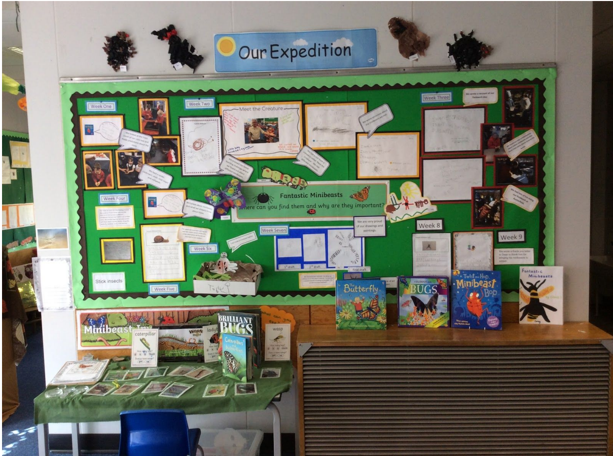
We share our learning on our classroom display walls.