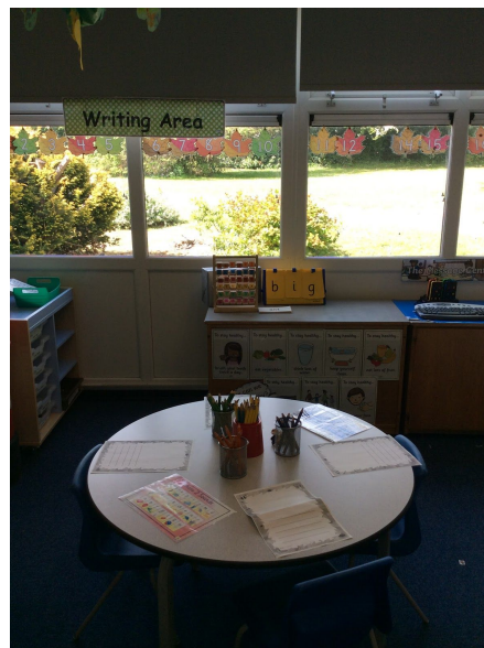
Mark making area where you can draw, write and do finger exercises to make your little fingers stronger.