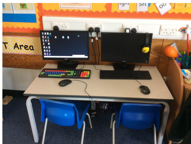
ICT area - you can use the computers or play with programmable toys.