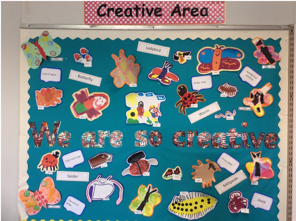
We are always busy being creative.