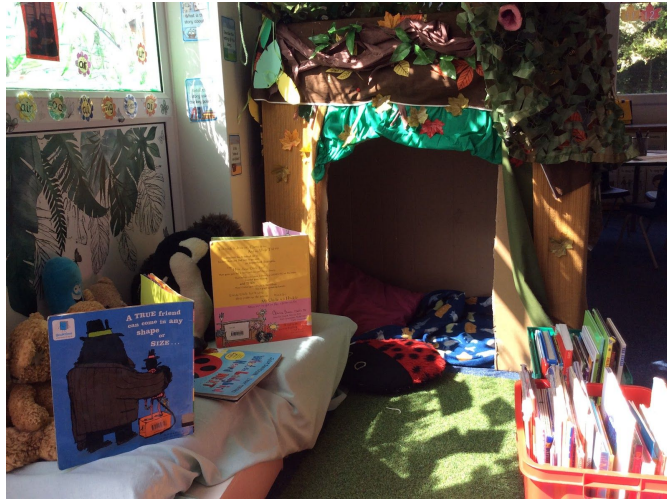
Reading area where you can snuggle up and read a book.