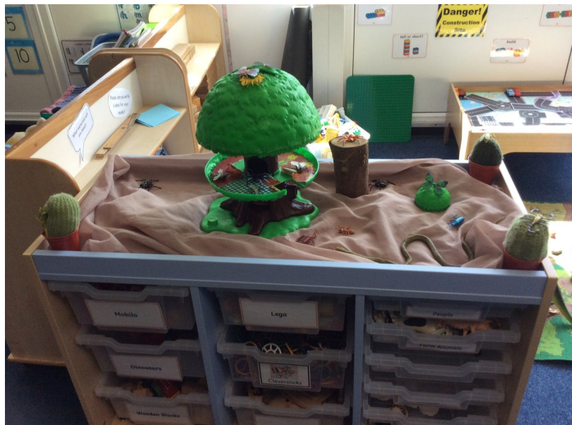
We have a small world and construction area in each classroom.