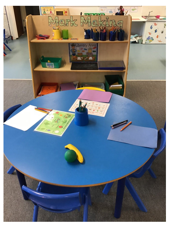
Mark making area where you can draw, write and do finger exercises to make your little fingers stronger.