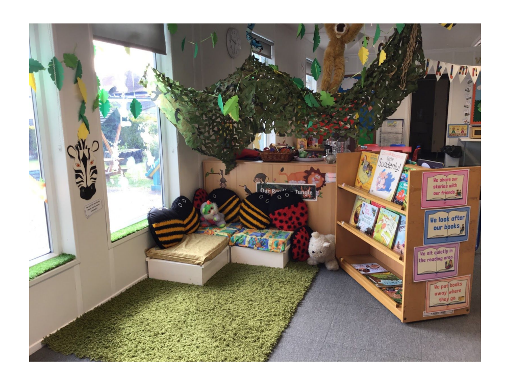
Reading area where you can snuggle up and read a book.

It will help your child if you can talk to them about the areas they will be able to play and learn in whilst at nursery: