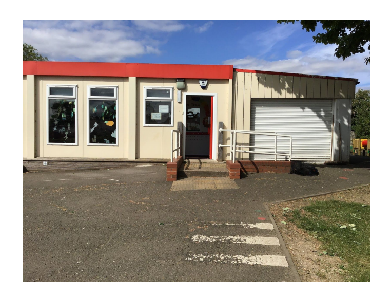
This is the door you will use to get into Nursery.

We would like to welcome your child and your family to our Nursery.