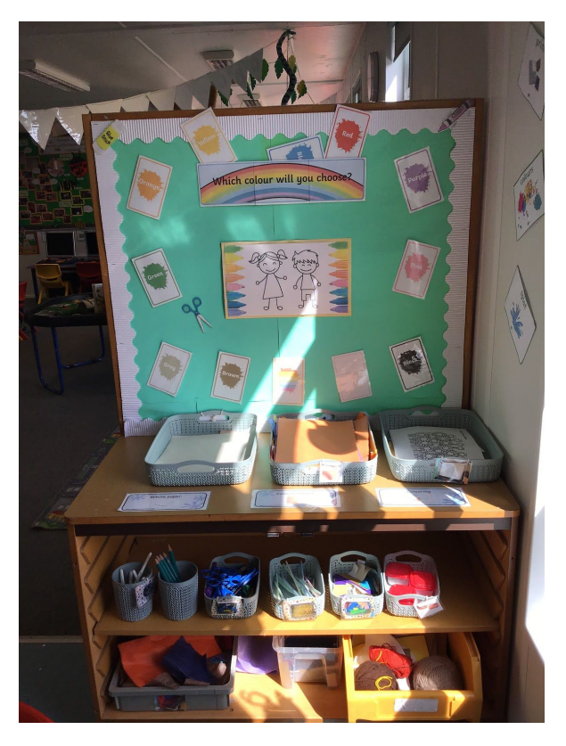
Creative area - you can make fabulous pictures using scissors, glue, paper, ribbon, wool, material....it's always lots of fun!