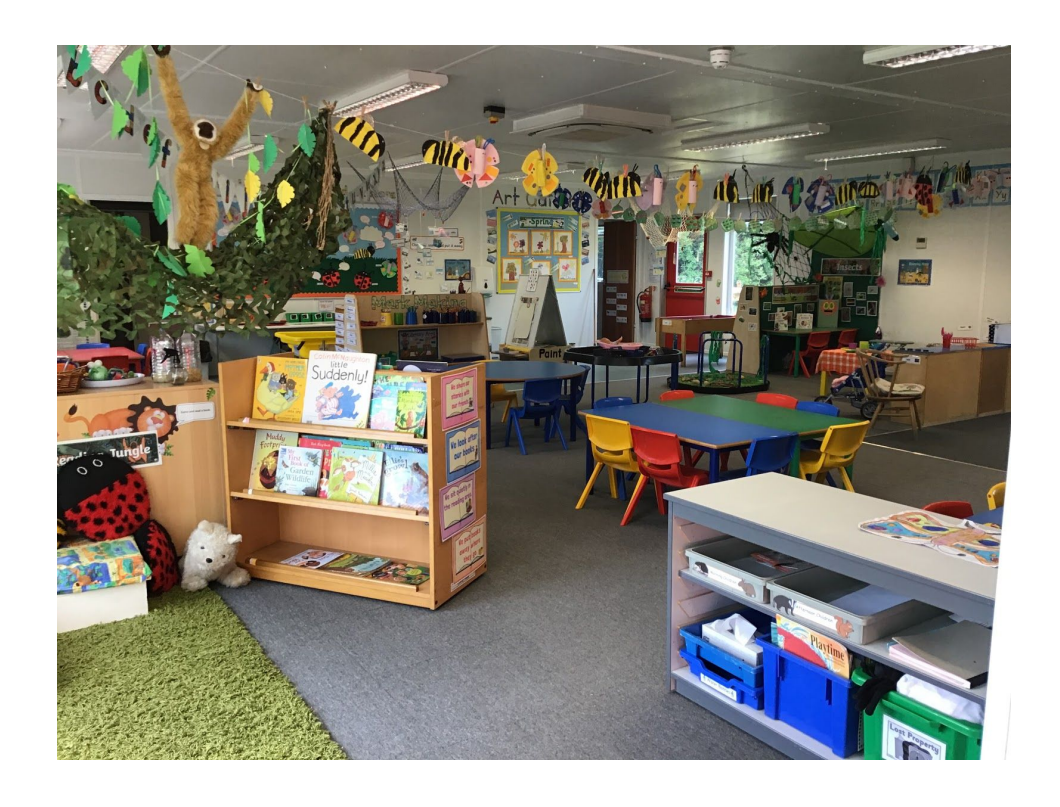
This is what you will see when you enter the nursery.

It will help your child if you can talk to them about the areas they will be able to play and learn in whilst at nursery: