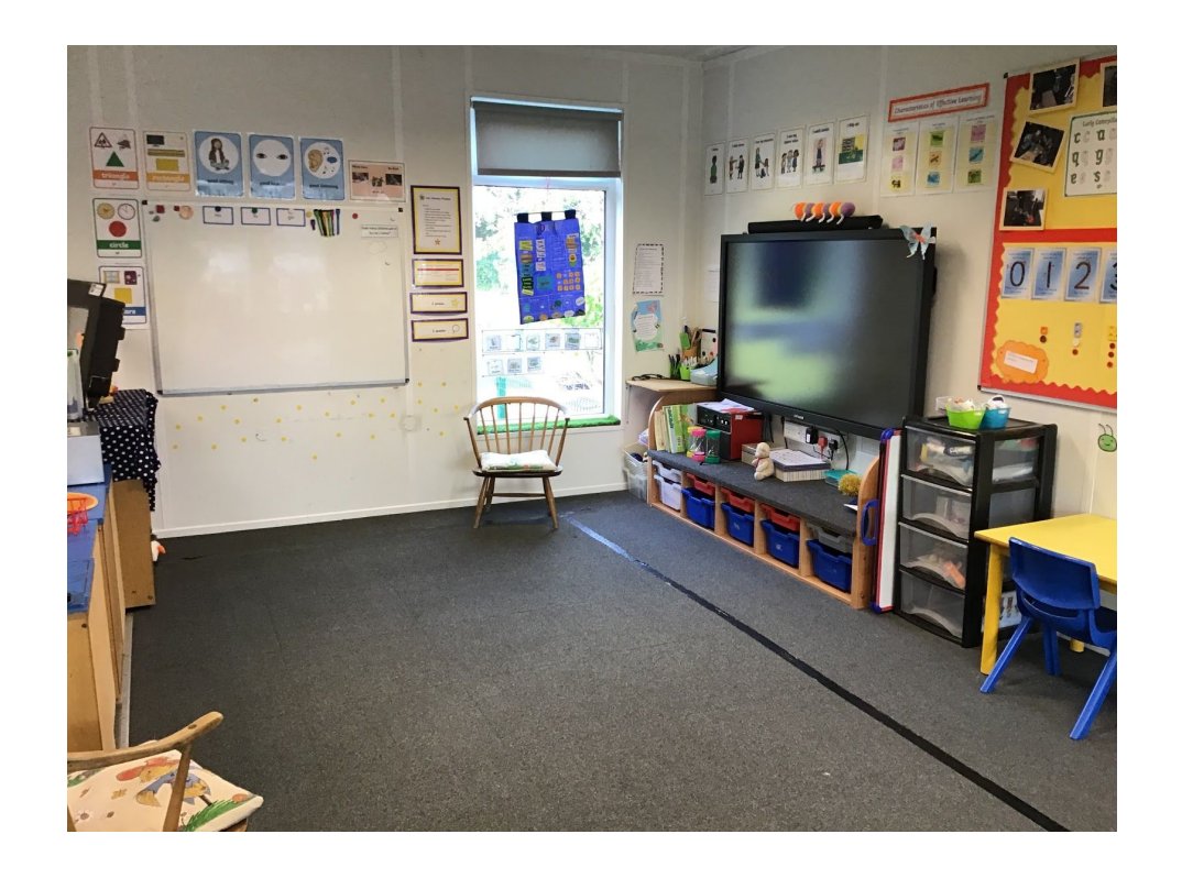
The carpet area where we do our register, listen to stories and sing songs.