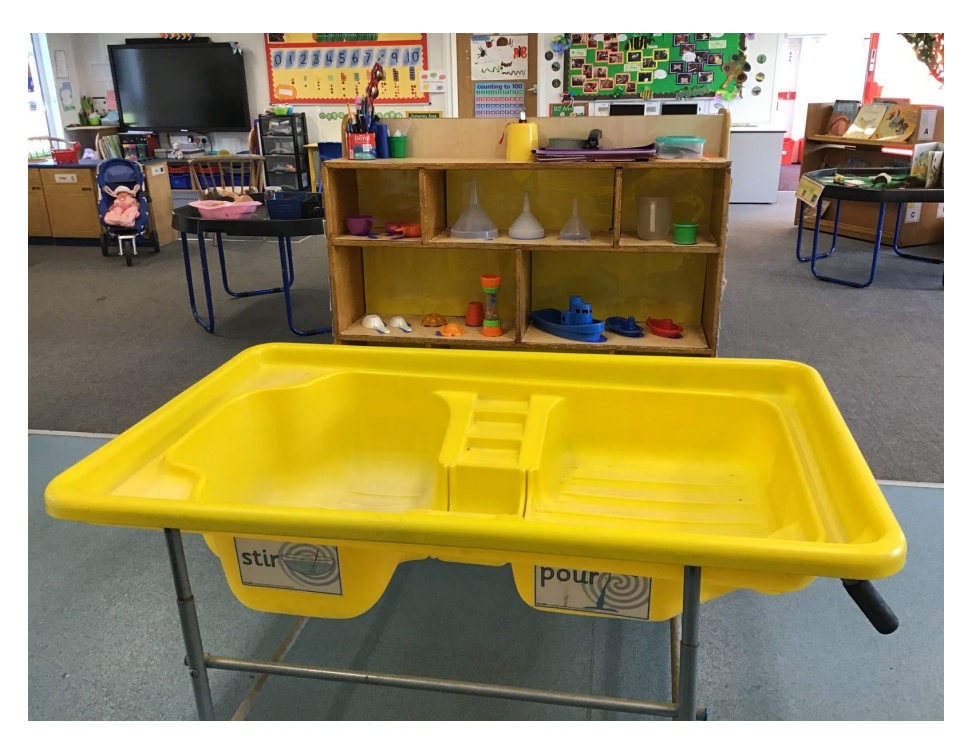
Water area - to fill and pour, go fishing or play with boats and creatures that live in water.