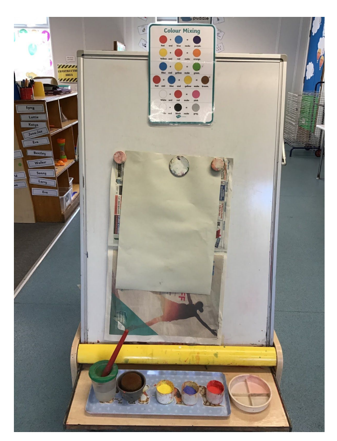
Painting area - you can practise mixing colours together and use paints to make pictures.