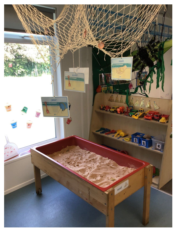
Sand area where you can build sandcastles, use diggers or hide shells for your friends to find.