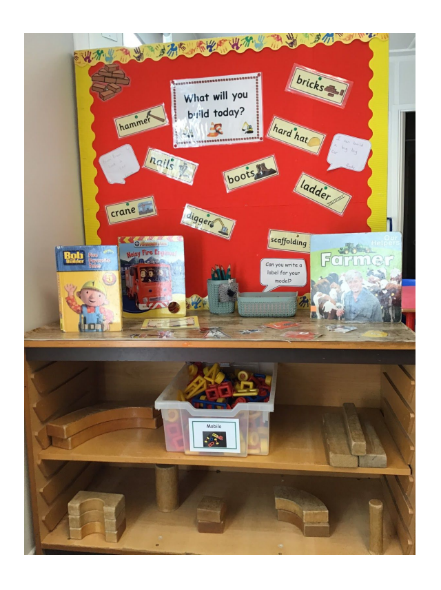
Construction area where you can use wooden blocks and other equipment to build models.