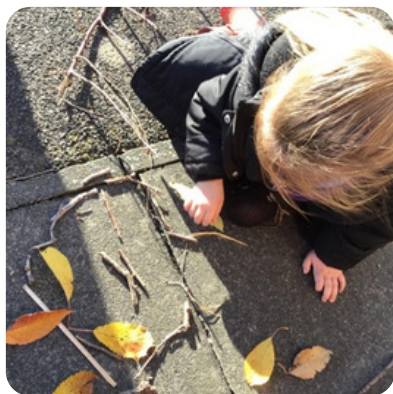
Building & Joining