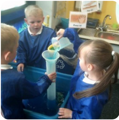
Weighing & Measuring