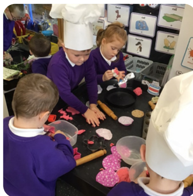
Handling tools safely