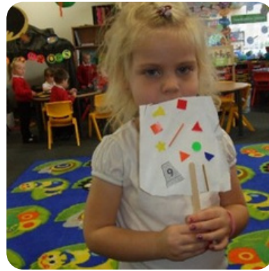
Art & Craft