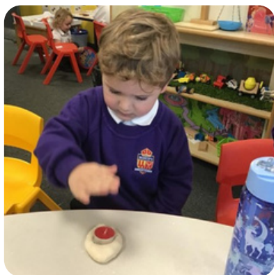
Pinching & Kneading