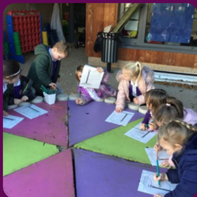
Helping each other