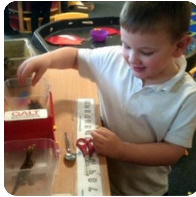
Playing games to recognise numbers and count objects