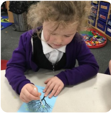
Music & Singing