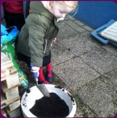
Observing the environment