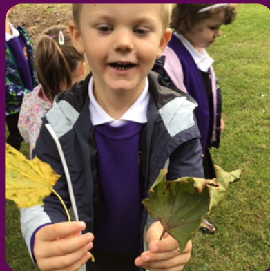
Caring for living things