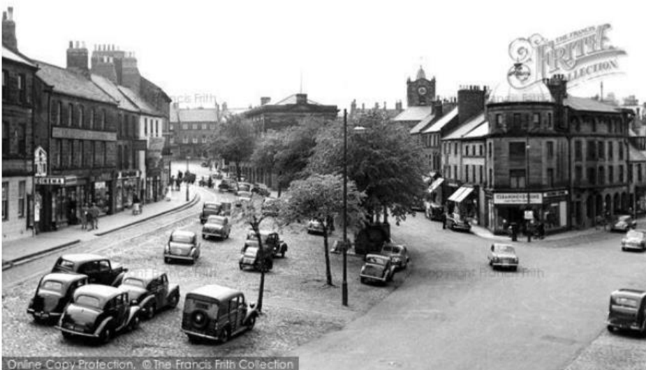
Alwick, Bondgate And Market Place c.1955

Online Copy Protection, © The Francis Frith Collection