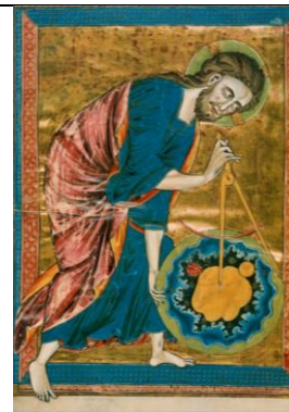
God as the Great Architect