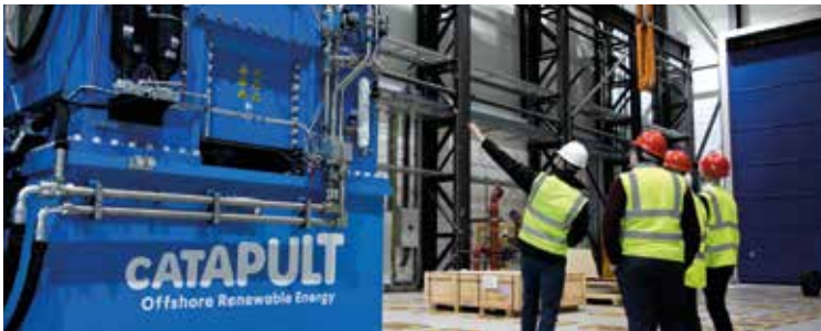
All of our Year 12 students complete one week's work experience at a destination of their choosing. This work experience week takes place in March.

Enrichment takes place weekly and students also support lower school enrichment opportunities to improve their skills in leadership and communication.