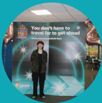
Art Foundation Diploma