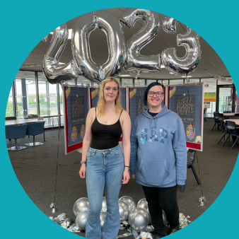
Care Assistant & Salford University