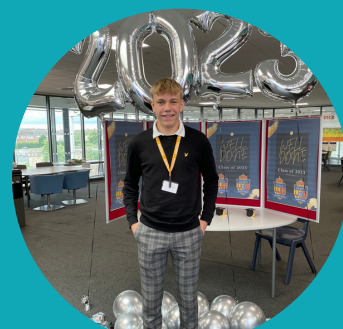
Business Admin Apprentice