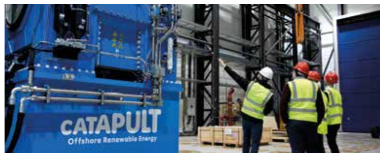
All of our Year 12 students complete one week's work experience at a destination of their choosing. This work experience week takes place in March.

Enrichment takes place weekly and students also support lower school enrichment opportunities to improve their skills in leadership and communication.