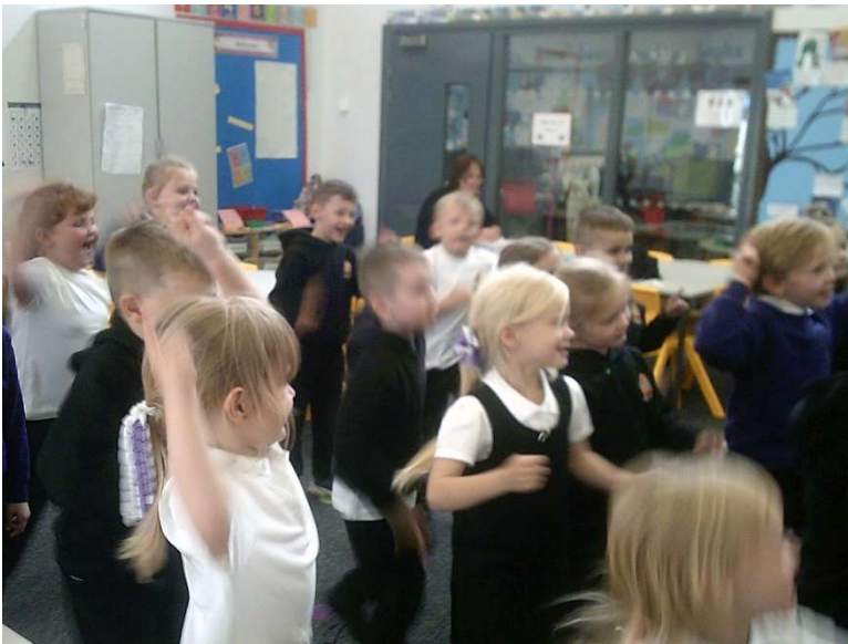
Year 1 at Grace Darling Campus (pictured left) taking part in their regular daily class workout 'Jump Start Jonny'