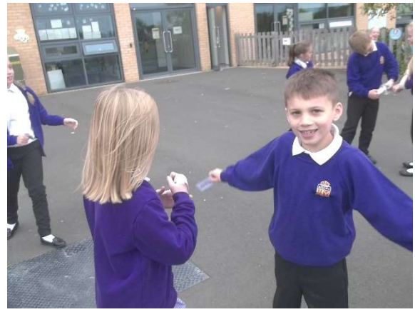
ACTIVE MATHS Year 4 at JBP playing 'Fish and Sharks' to practise rounding numbers to the nearest 10, 100 and 1,000.