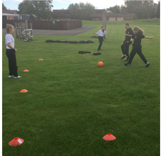
Year 6 children at James Knott (pictured below) leaning ball control skills during Games.