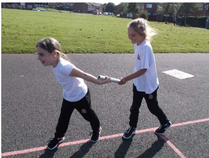
Year 3 at Josephine Butler (pictured below) learning how to correctly pass the baton on in their Athletics lesson.