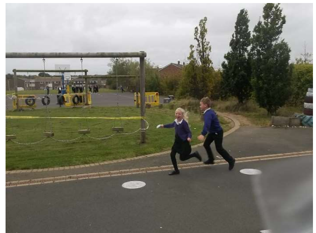
THE DAILY MILE Year 3 at Josephine Butler (below) and Y3 at James Knott (bottom) taking part in their Daily Mile – a great start to the day!