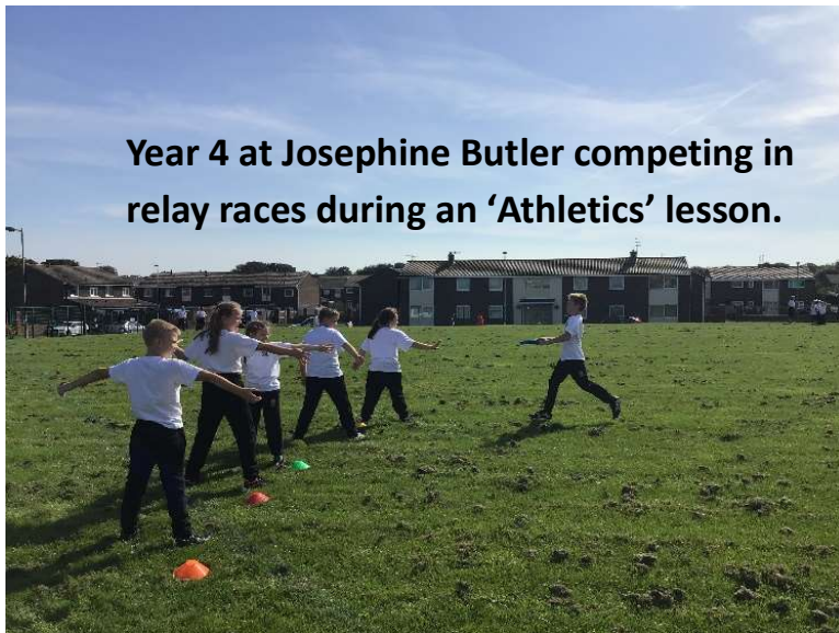
Year 4 at Josephine Butler competing in relay races during an 'Athletics' lesson.