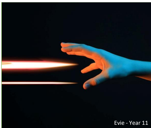
Evie - Year 11

Photography is an Art GCSE. Students studying photography learn how to create and manipulate digital images. More importantly arts subjects encourage self-expression and creativity and help build student confidence as well as a sense of individual identity.