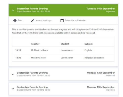
Step 8: Finished

All your bookings now appear on the My Bookings page. An email confirmation has been sent and you can also print appointments by pressing Print . Click Subscribe to Calendar to add these and any future bookings to your calendar.