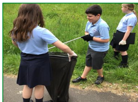
Above: pupils from St John Boste School taking part in a community litter pick in Sunderland.

Since June 2021, the Visitor Education Centre has visited 16 schools across the region to organise litter picks and carry out workshops.