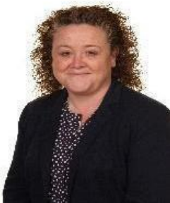
A Moody Head Teacher

We look forward to meeting you all and to seeing the journey your child will take during their time with us.