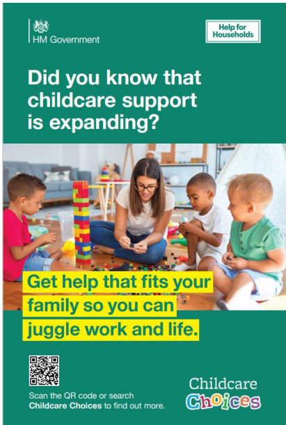
Out of home (6 sheet)