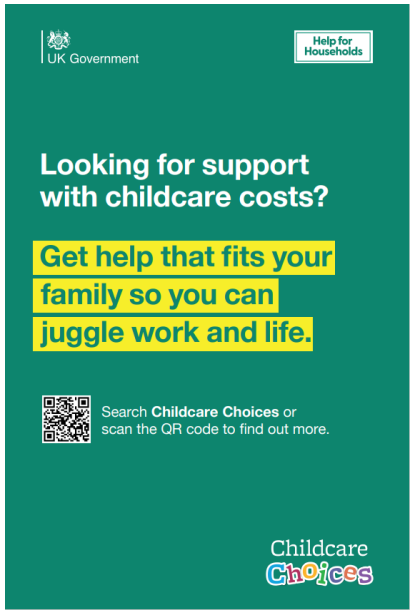
Out of home (6 sheet)