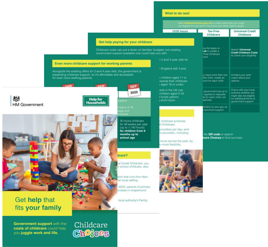
A5 double-sided leaflet

Download or print out these campaign creatives for your channels here. Both digital and ready to print versions are available.