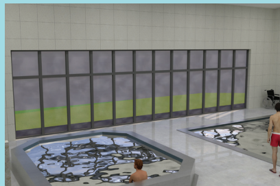
Proposed Hadrian Community Spa

The main issues relating to this pre-application enquiry relate to: