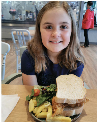
A proposed cafe that will serve the new facilities.

We predict that we will triple the current footfall we have by introducing the new facilities, and have approx. 300 independent users per week and 180 children from Hadrian School.