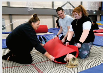
Rebound Therapy Centre