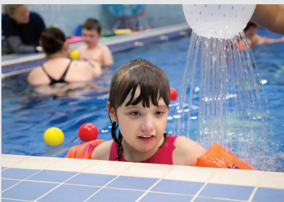
Current Hydrotherapy Pool