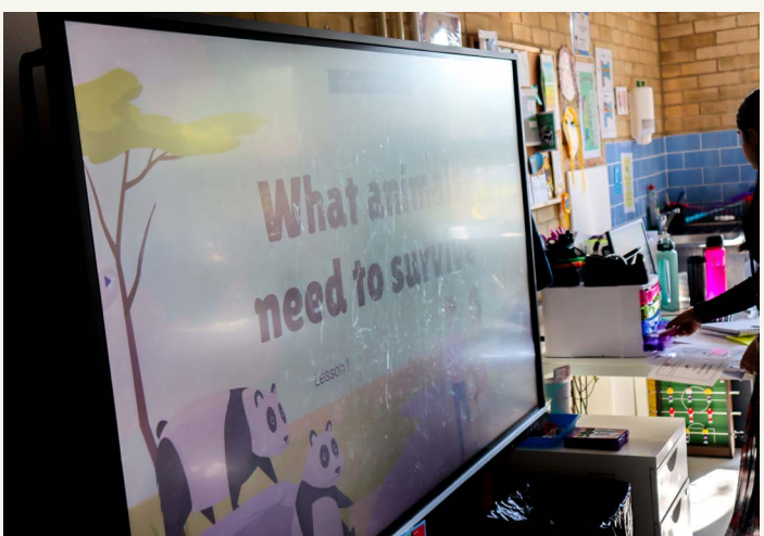
Rimon class learn more about what animals need to survive in a recent PBL lesson.