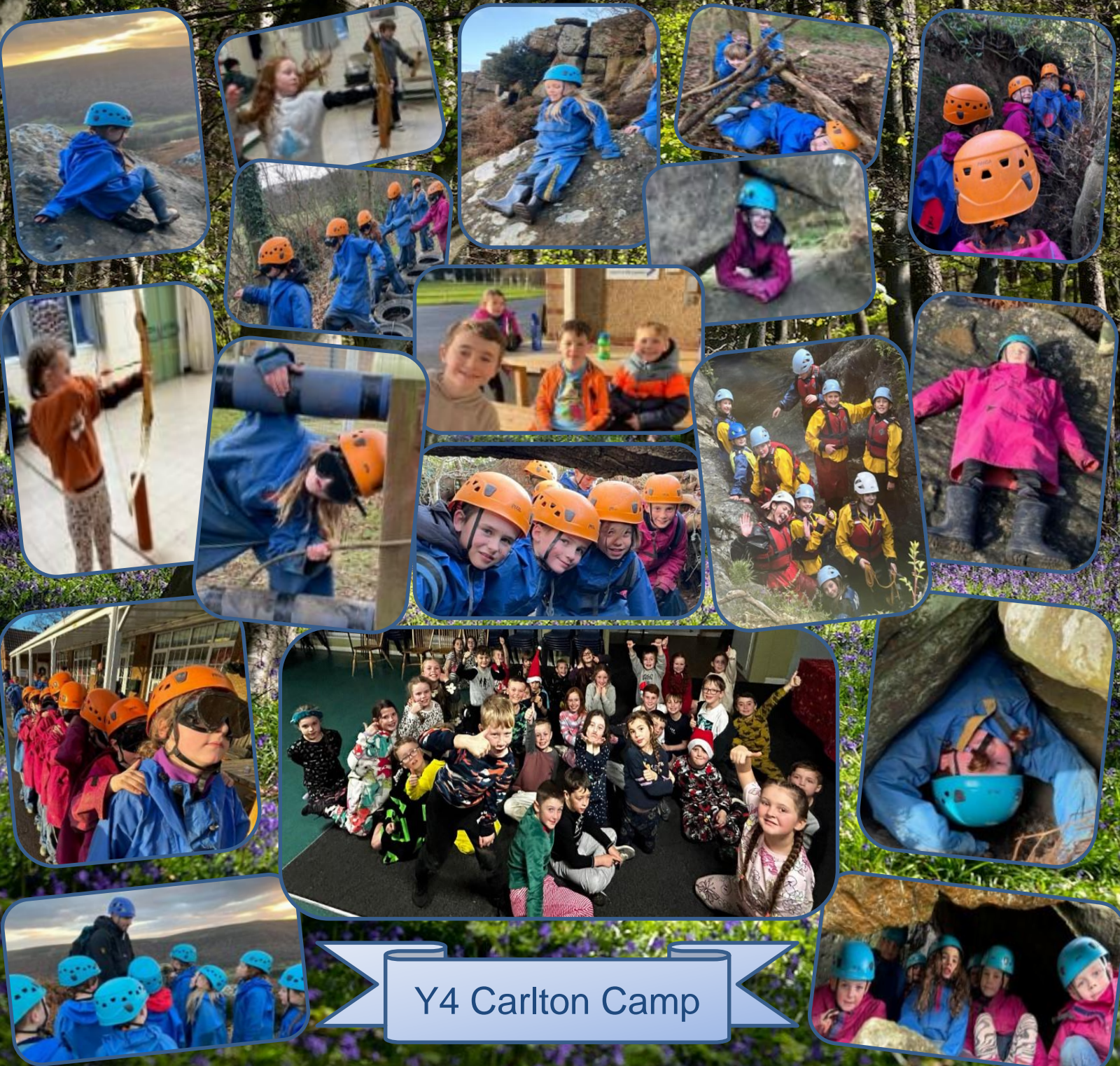
Y4 Carlton Camp