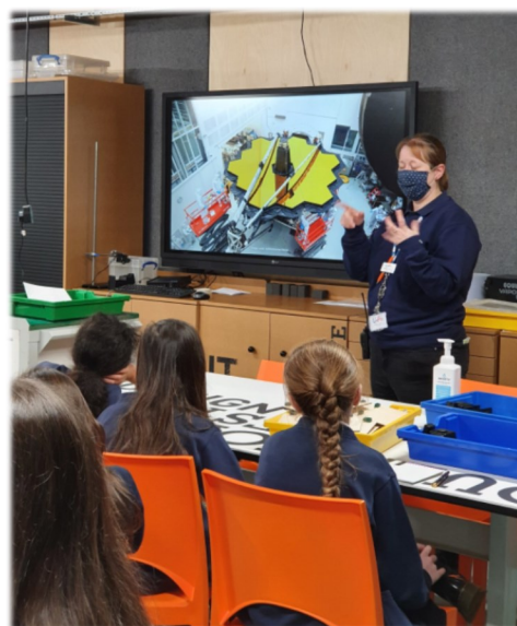
Centre for Life