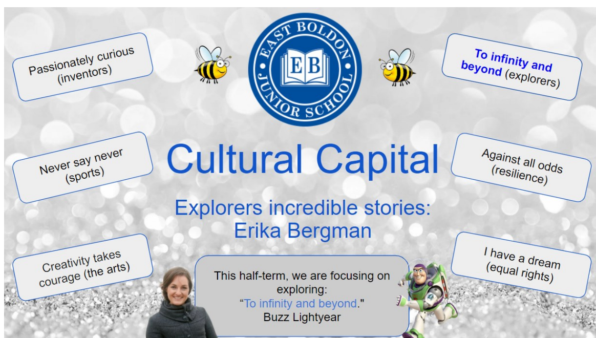
Example of one of our Cultural Capital assemblies

We have weekly Cultural Capital assemblies that raise aspiration, build resilience and widen experiences. The assemblies promote worldwide music with our weekly artist from 'Model Music Curriculum' including special events like Black History Month and Pride Week.