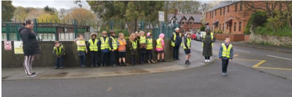
Year 3 Garage Band and Pedestrian Training