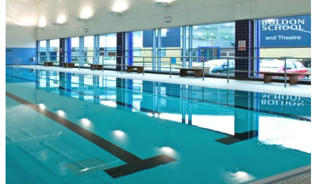
Year 5 Swimming

Thank goodness that we can start to reengage with external agencies again. The children have coped incredibly well given the circumstances in the world this last year, but we are delighted to begin to allow music, sports coaches and language teachers into our school safely again.