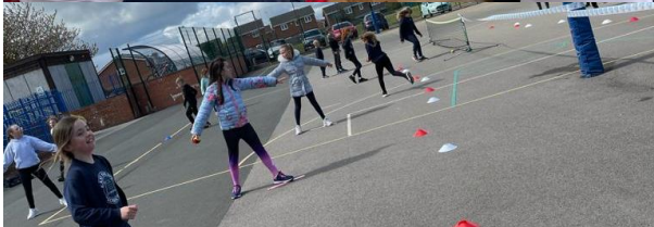
Year 4 recorder and tennis lessons