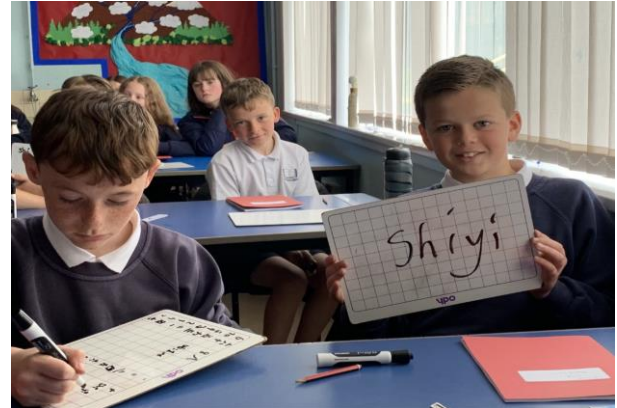
Year 6 Mandarin and transition events