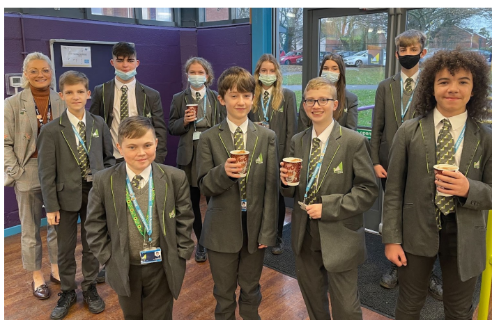
Year 9 Headteacher Brunch invitees