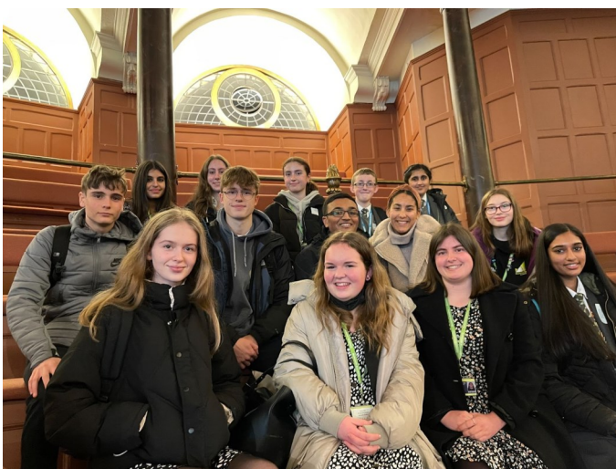
Ready for our World Class Re-accreditation inside the Sheldonian Theatre, Oxford