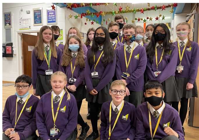
Year 8 Headteacher Brunch invitees