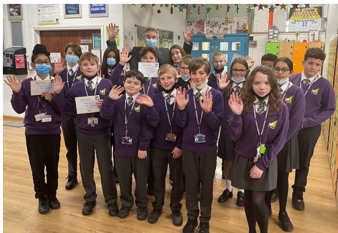
Year 7 Headteacher Brunch invitees