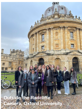
Outside the Radcliffe Camera, Oxford University