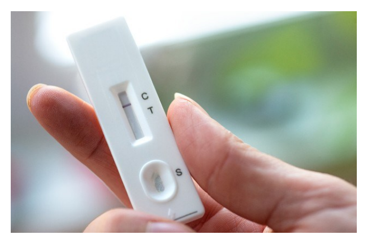
Taking the test

Tests are free of charge. There are 7 tests in a box with a leaflet on how to take the test and report the results.